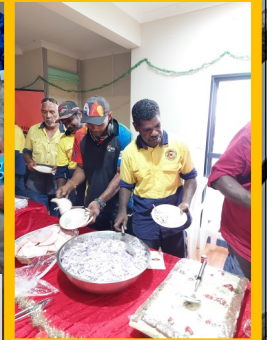
DASC says "Thank you" to their staff.