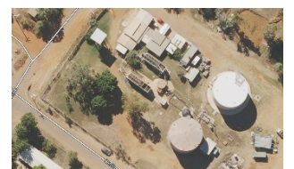
Water treatment facility