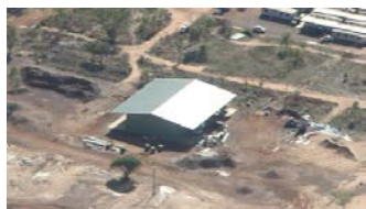
New work shed