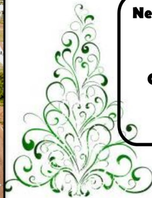
New Council Workshop Framework