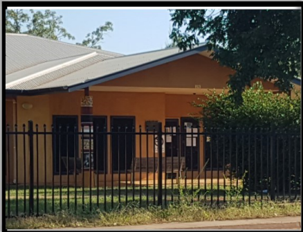
Beautification Team at Work

Thanks to Everyone who has worked to move our Community forward this year. Wishing you all a very Merry Christmas and Happy New Year